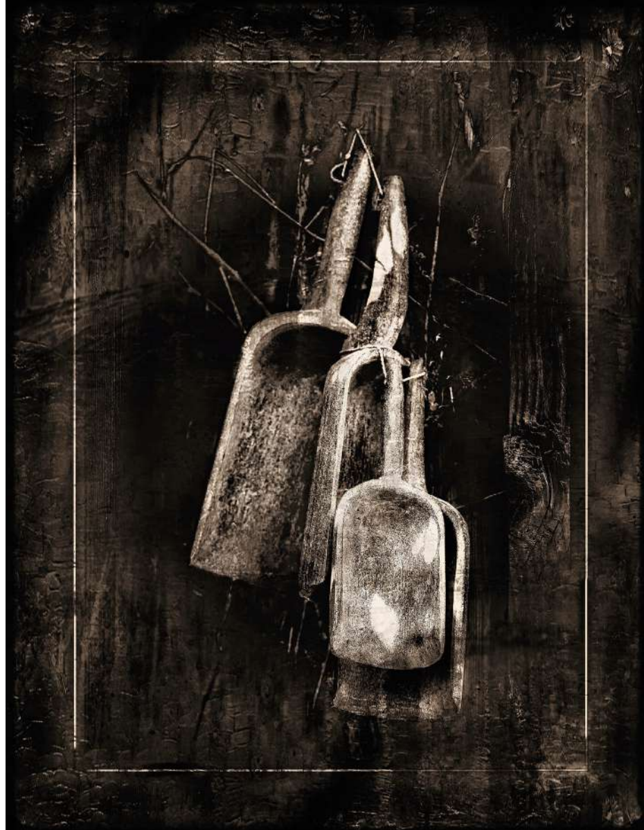
Vladimir Kabelik FOUR WOODEN SCOOPS photograph (archival pigment print - limited edition) 12.5" x 16" $800