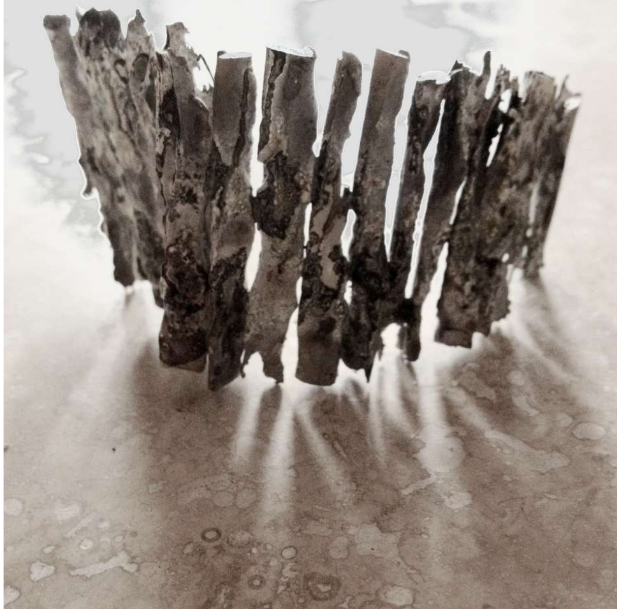
Dawn Loree Ramita Procesi3n pure .950 Silver 3" x 5.85" $600