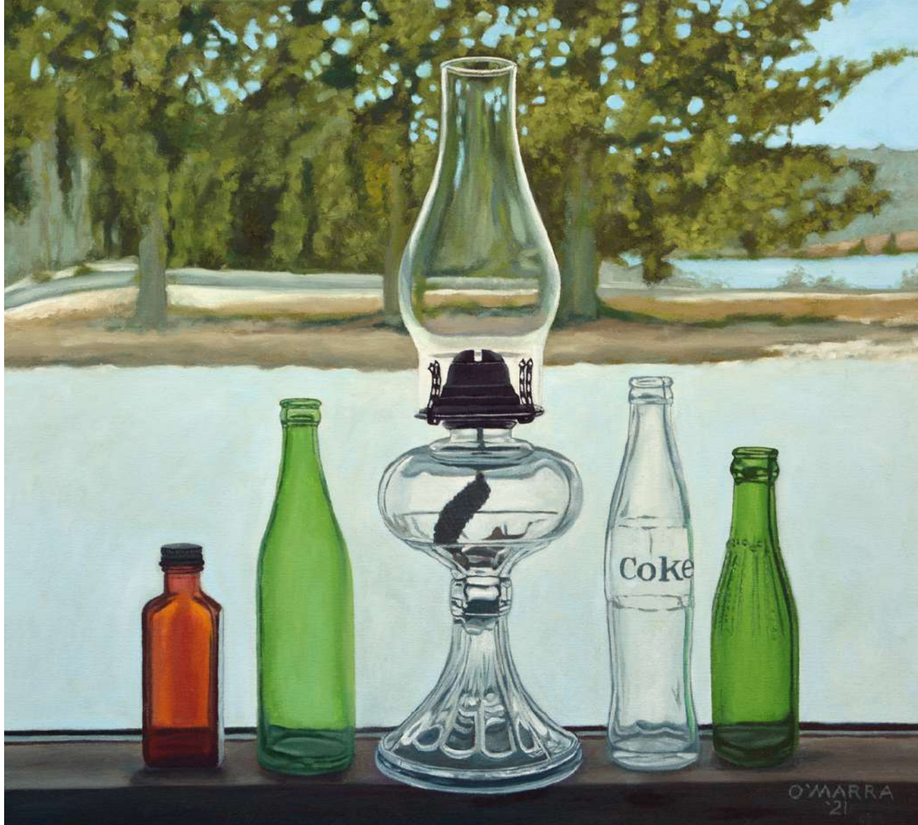
Allan O'Marra Lamp and Bottles Still Life Oil on canvas 20" x 22" $975