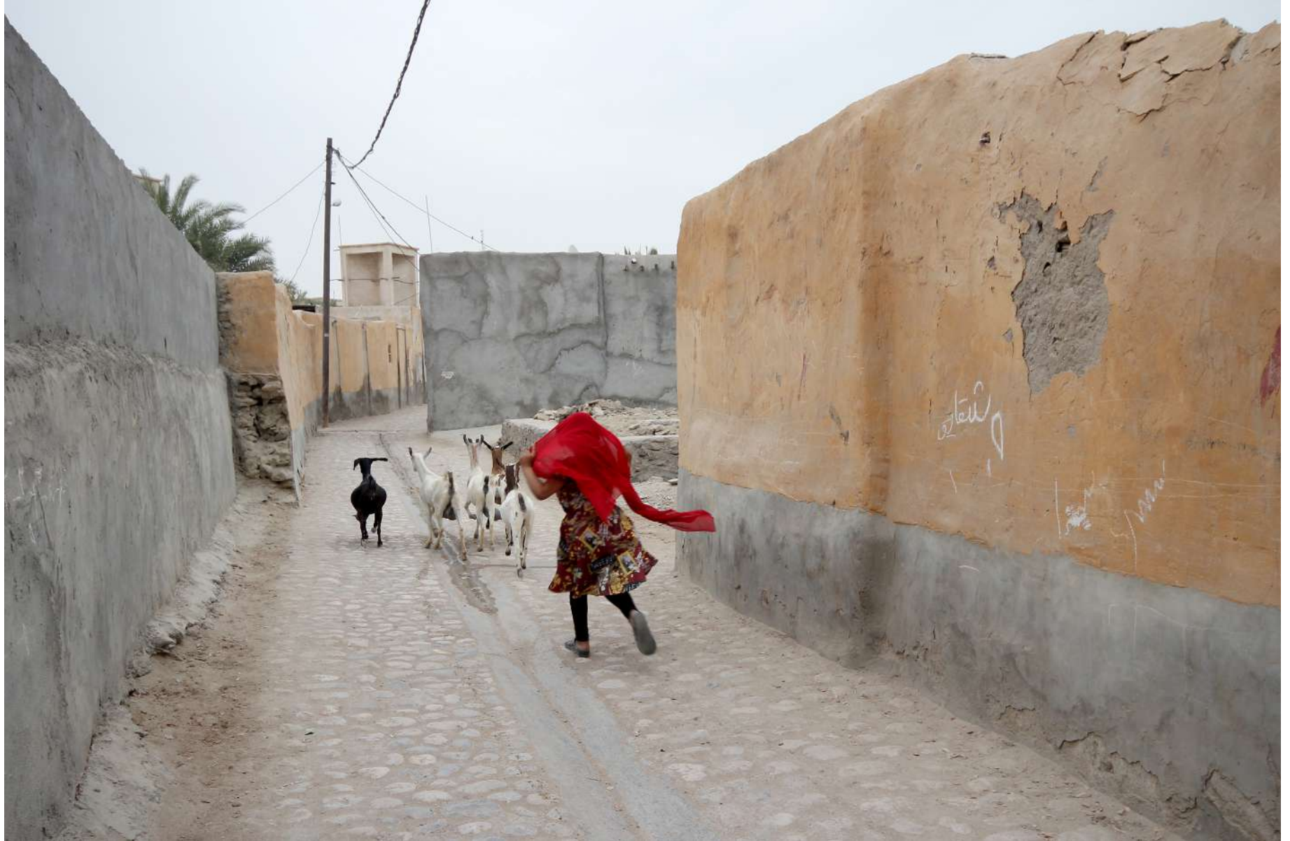
Sonia Beygi Play to Stay Alive Digital Photography 16" x 24" $900