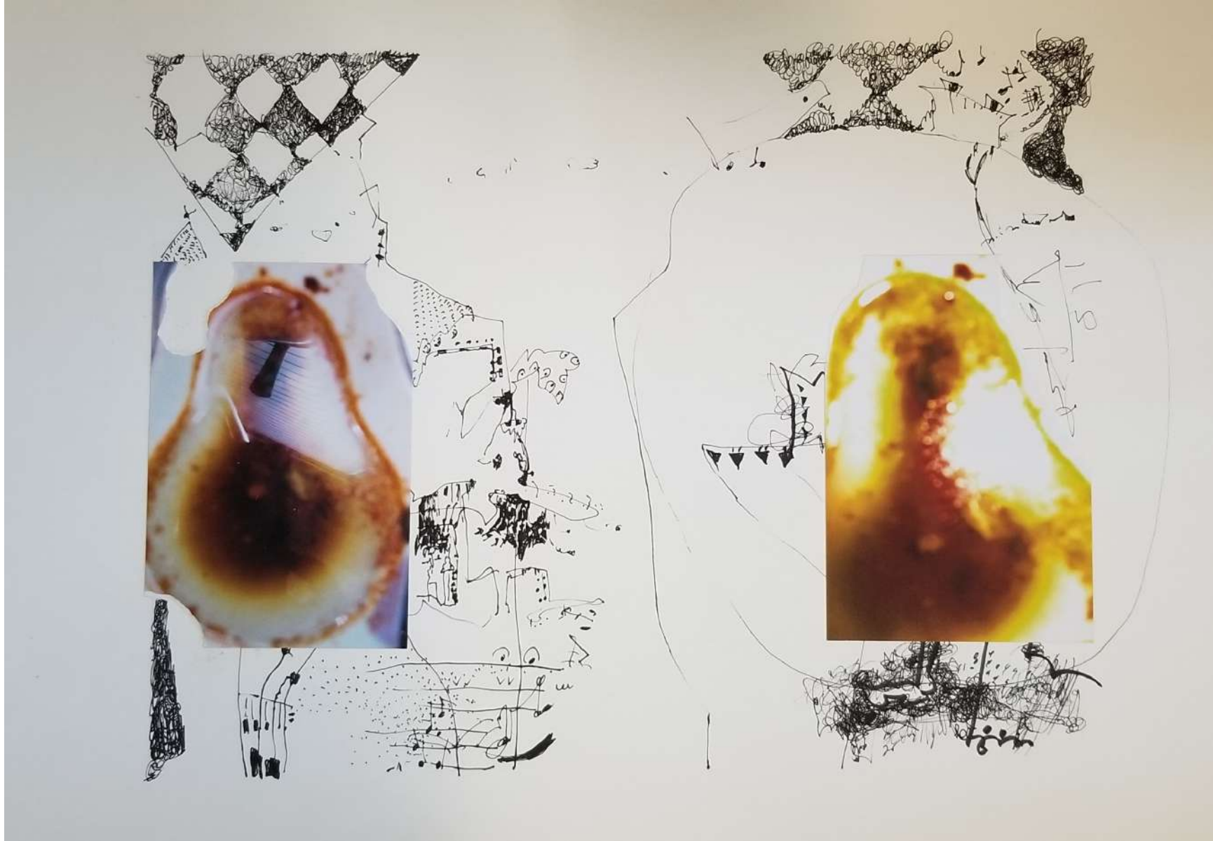
Jangmee Park The New Encounter Mixed Media on Paper 14" x 22" $1,400