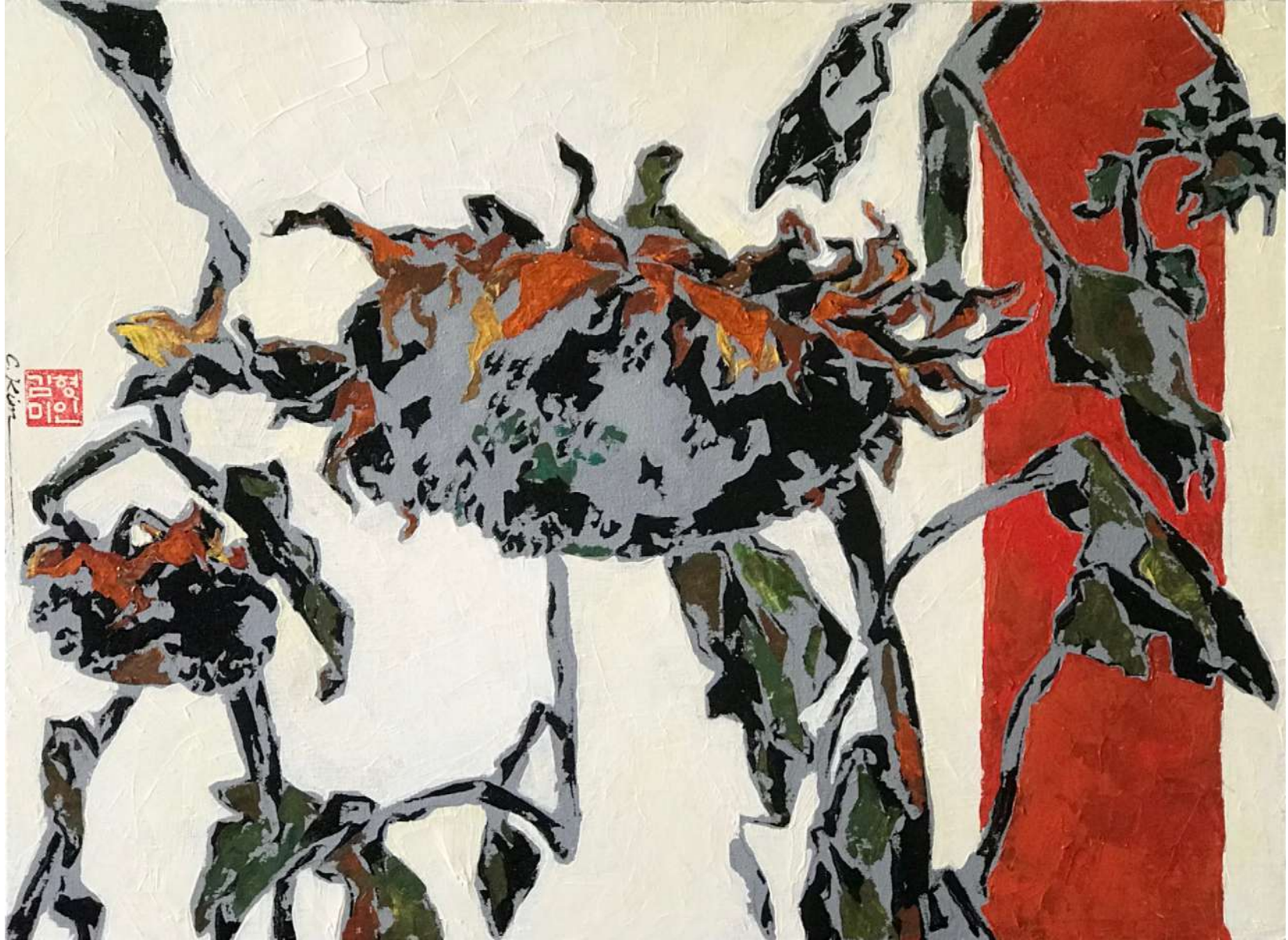
Clara Kim Relaxing Acrylic 24" x 18" $548