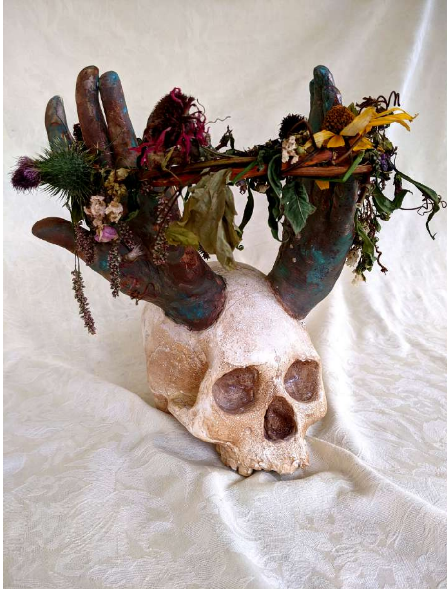
Marina Raike Grass Fed Digital Print 16" x 12" $700