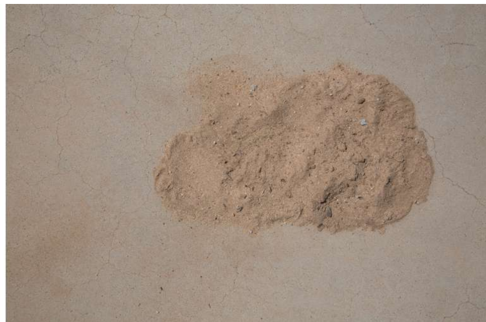
Mike Callaghan self-fulfilling and self-revealing photo / diptych 45" x 15" $1,500