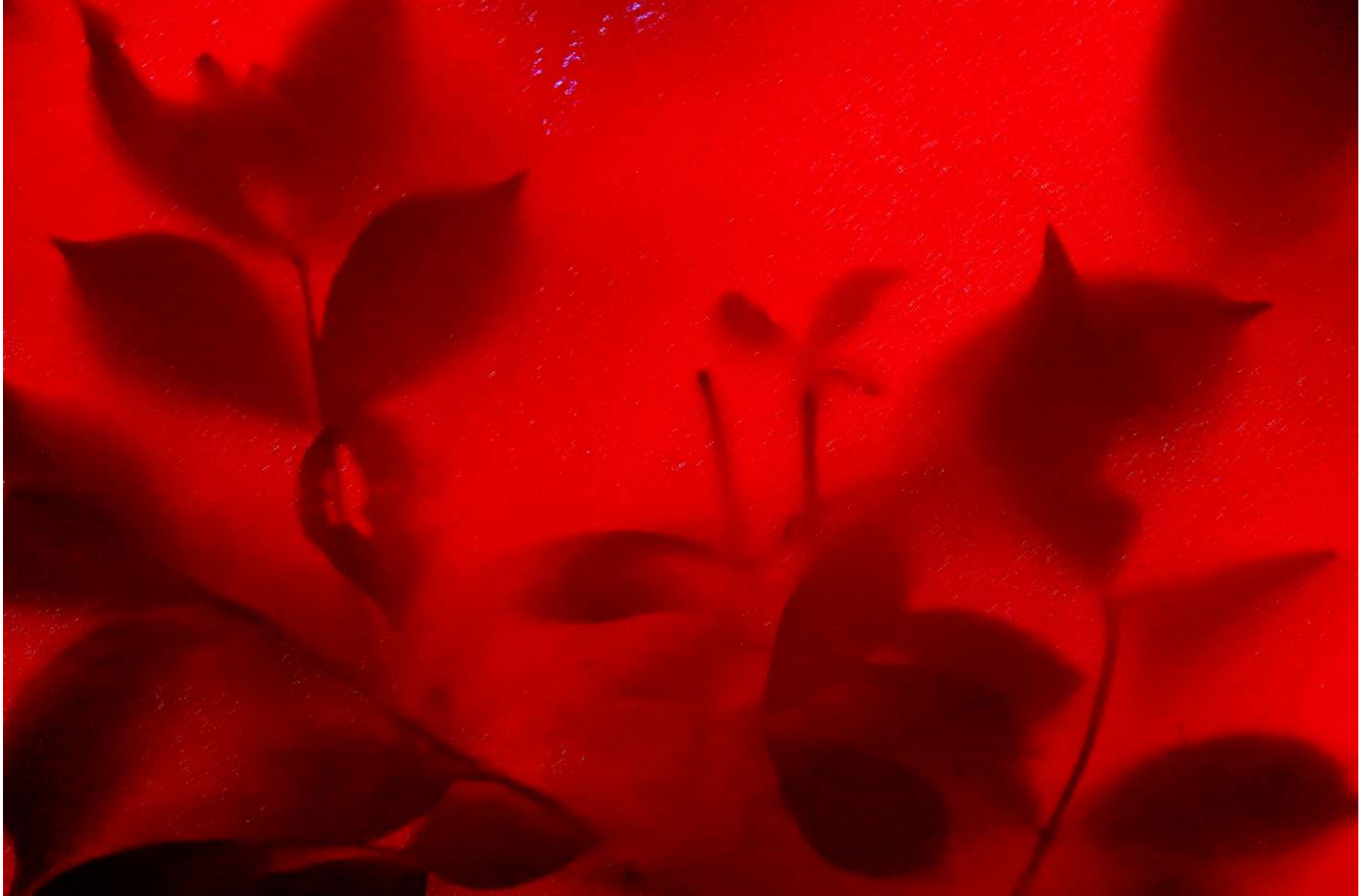
Heather Hess Il Covo Magica Digital Image 6000 x 4000 $200.00