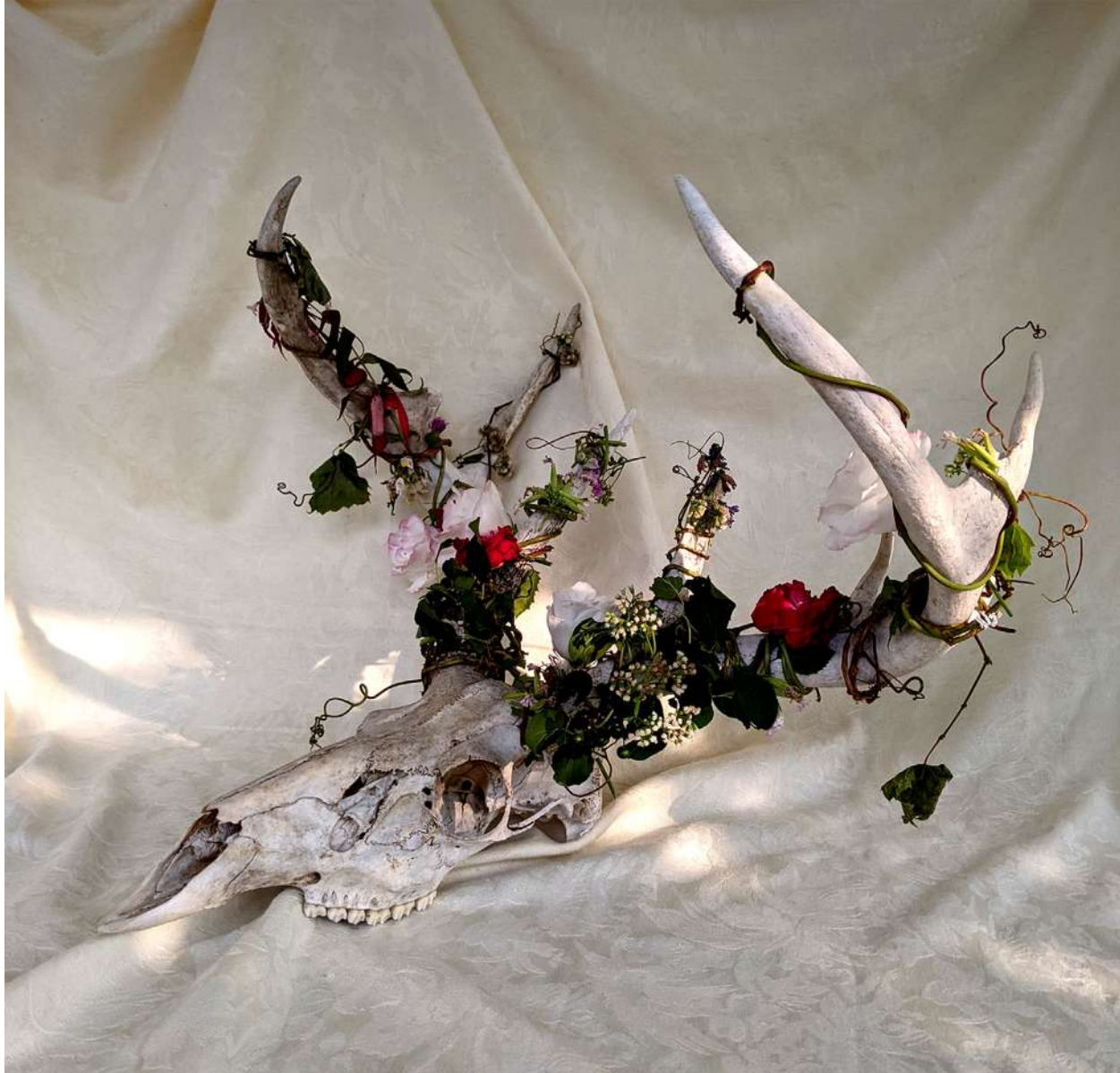
Marina Raike Don't Fade Away Digital Print 11" x 11" $550