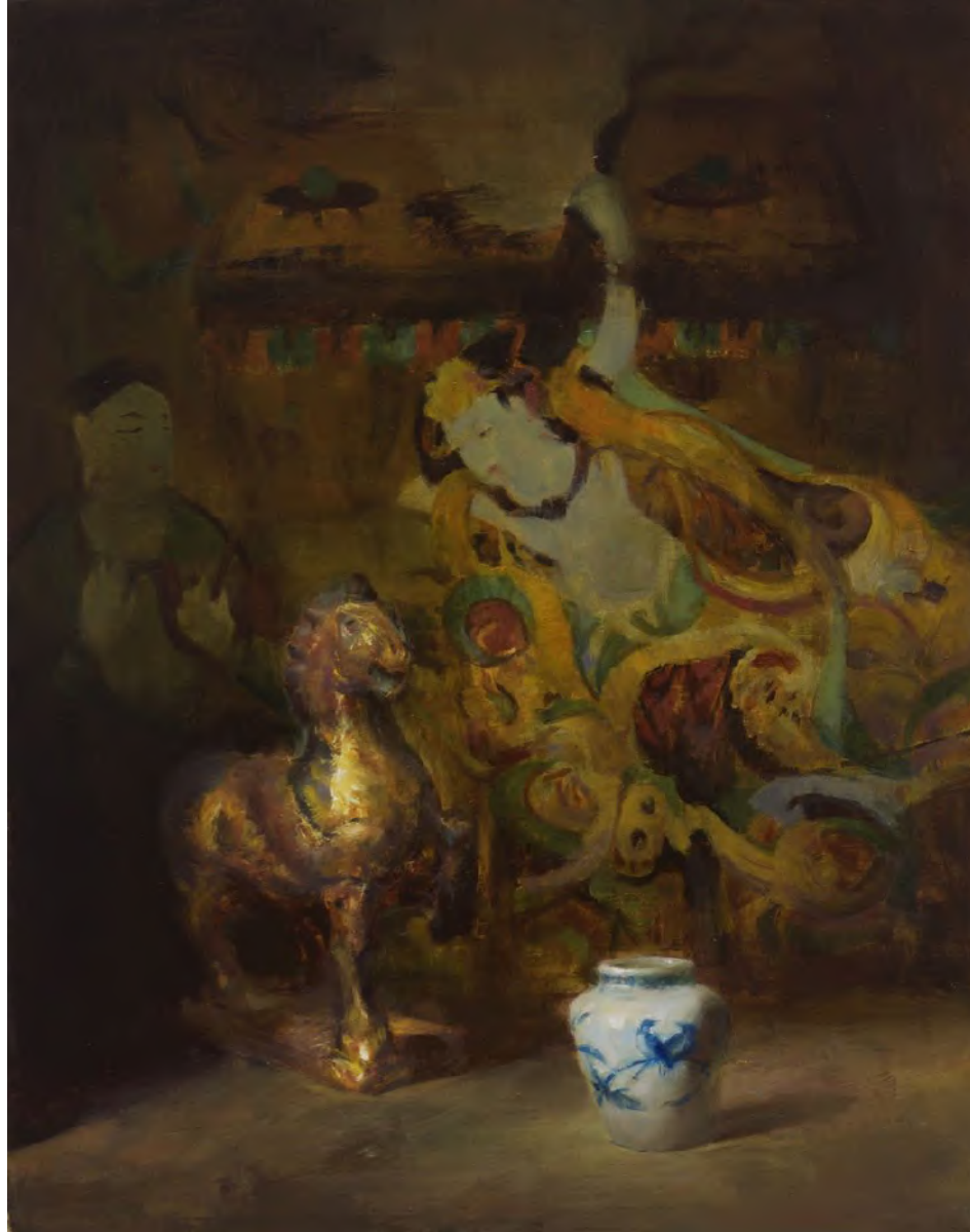
Chen Cao Running Horse Flying Heaven oil on canvas 14" x 17" $2,000