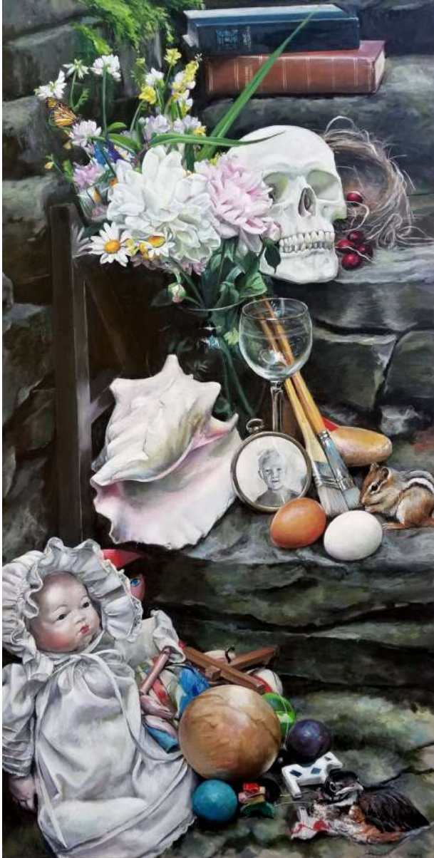
Anne Smythe Vanitas, Ages of Man Oil on Canvas 40" x 20" $1,295