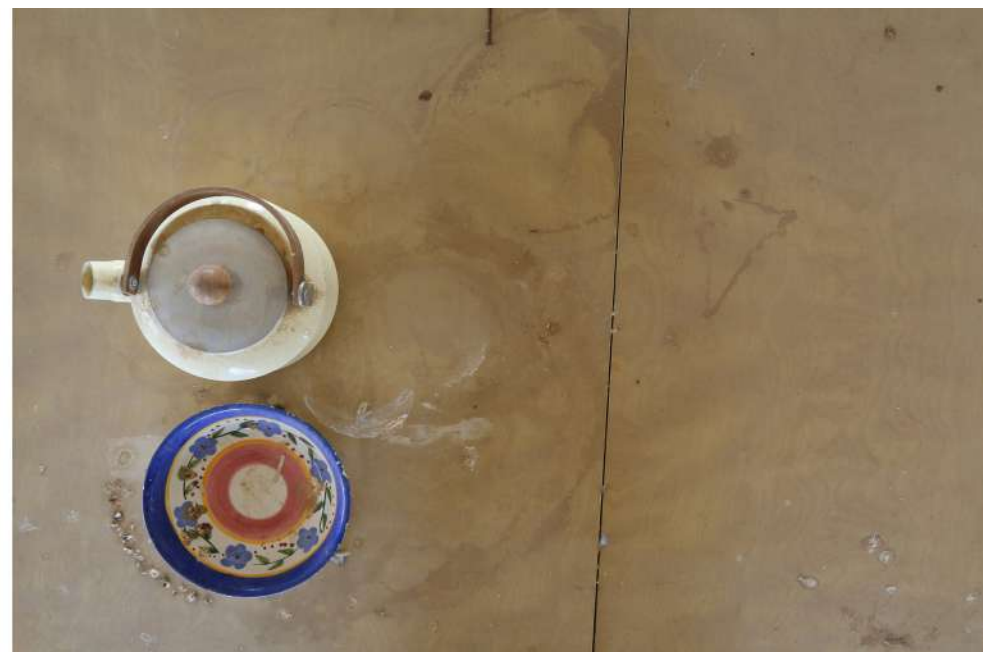
Mike Callaghan rise, open-mouthed photo / diptych 45" x 15" $1,500