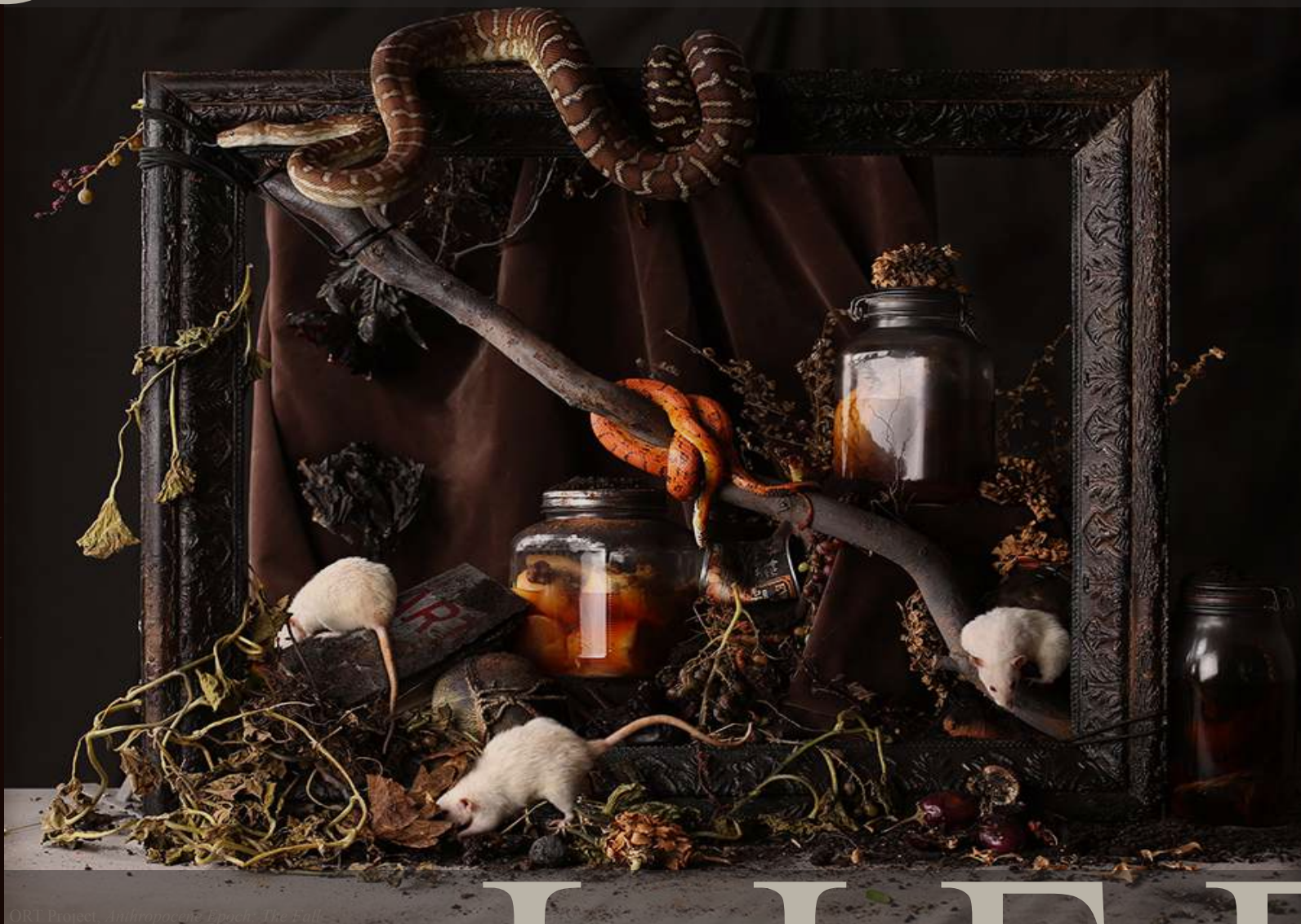
ORI Project: Anthropocene Epoch: The Fall