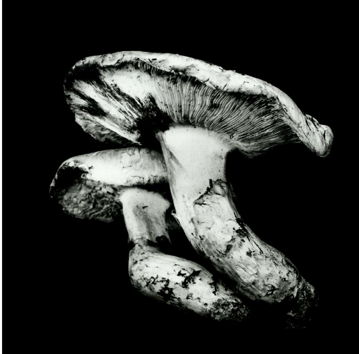
Dale M Reid Pine Mushroom 1 Silver Gelatin Print 28" x 28" $2,500