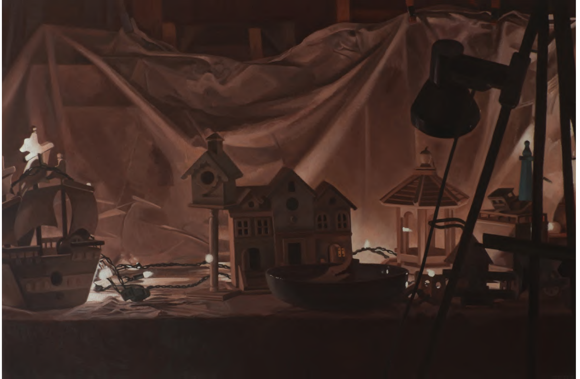
Maureen Paxton Gay Paree No. 2 Oil on canvas 32" x 48" $9,100