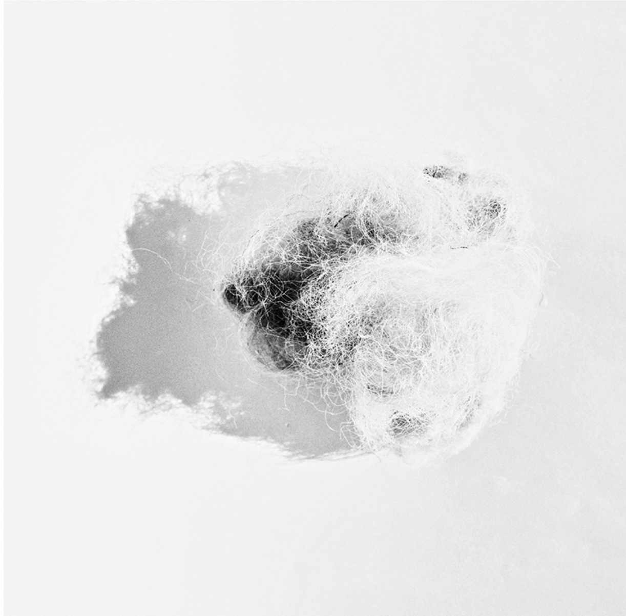
Jennifer Globush ÓSKILAMUNIR 1 Charcoal & graphite on paper 10" x 10" NFS