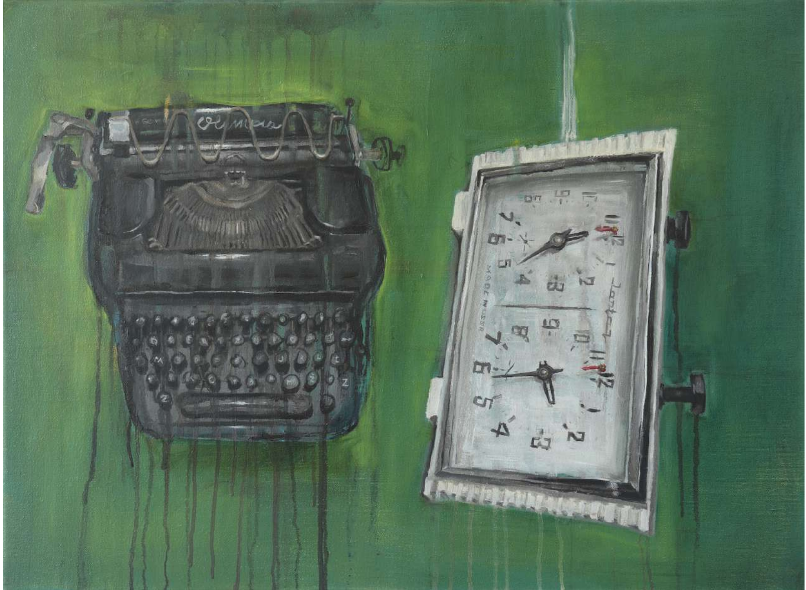
Dorota Dziong Mom and dad Oil on canvas 24" x 18" $700