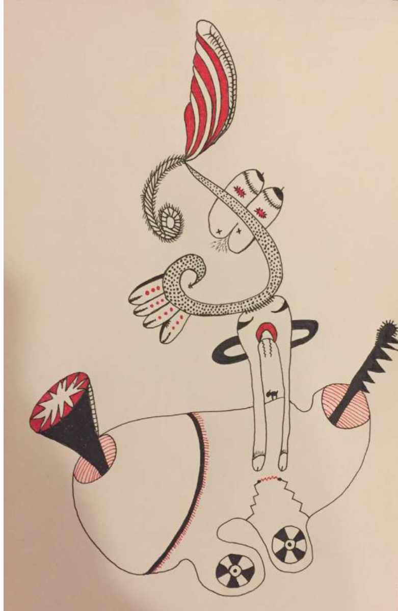
Itzik Giuli Untitled life 1 Drawing A5 $380