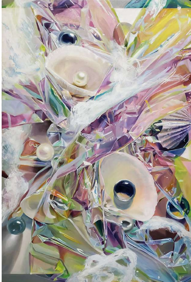
Hyun Young Yang Fruition-Dreaming Oil on wood panel 36"×24" $3,000