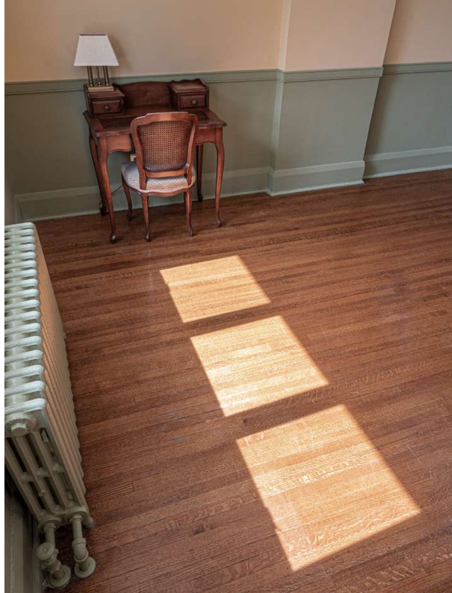
Lori Ryerson Shafts of Light photography 32" x 24" $775