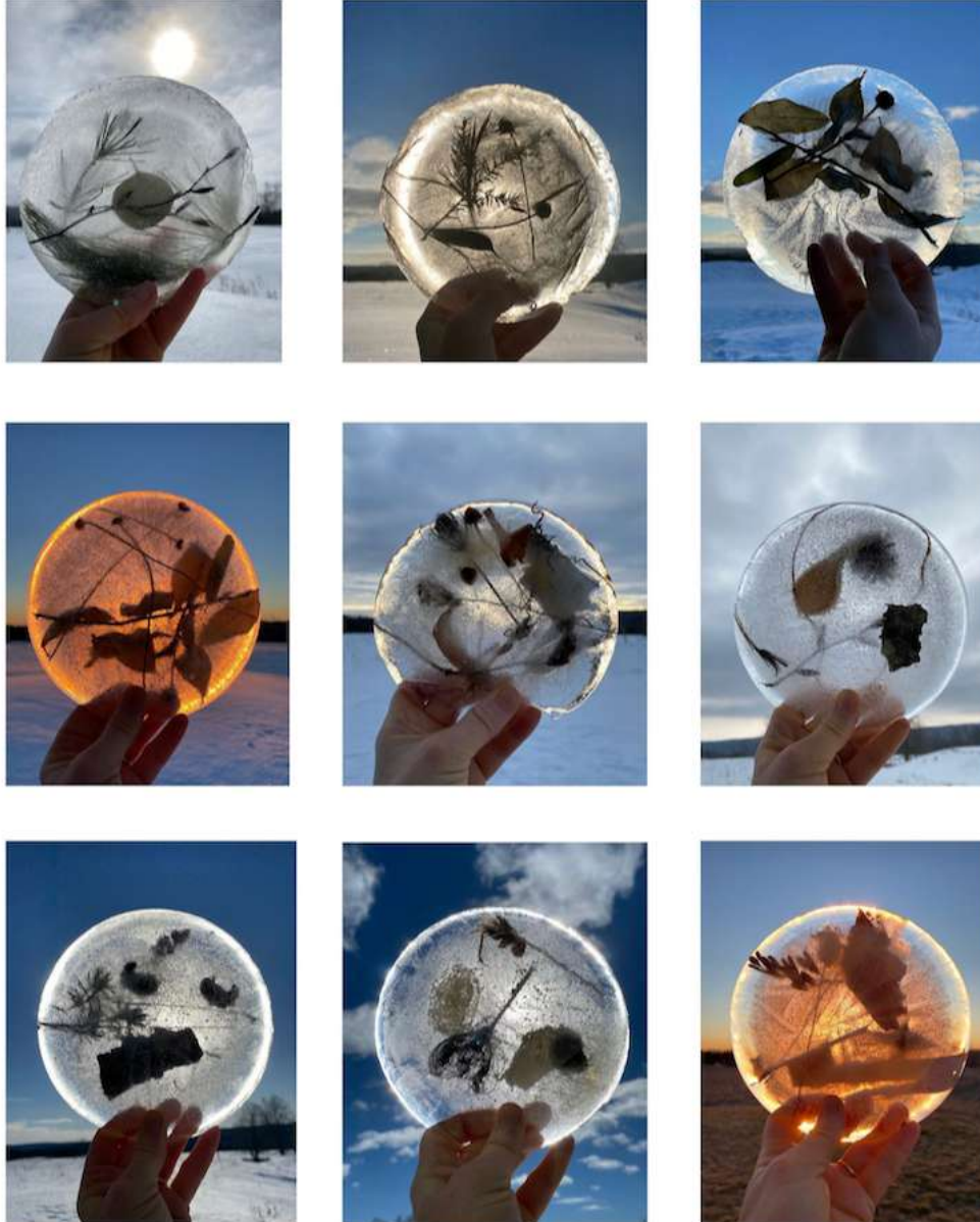
Deborah Farquharson Ice Moons 2021 Photograph 24" x 36" $800