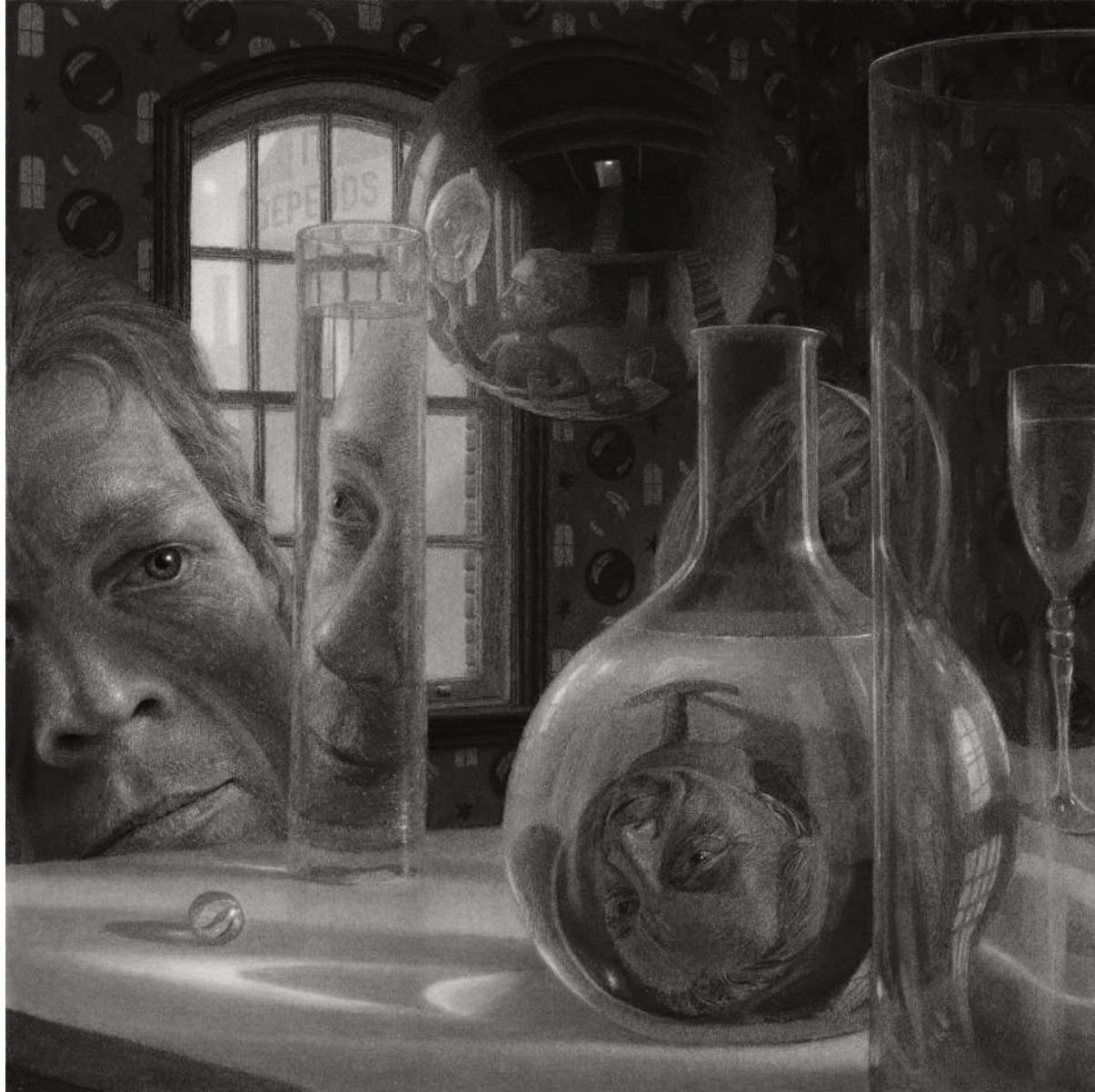
Frank Mulvey It Depends Charcoal on paper 30" x 30" $4,625