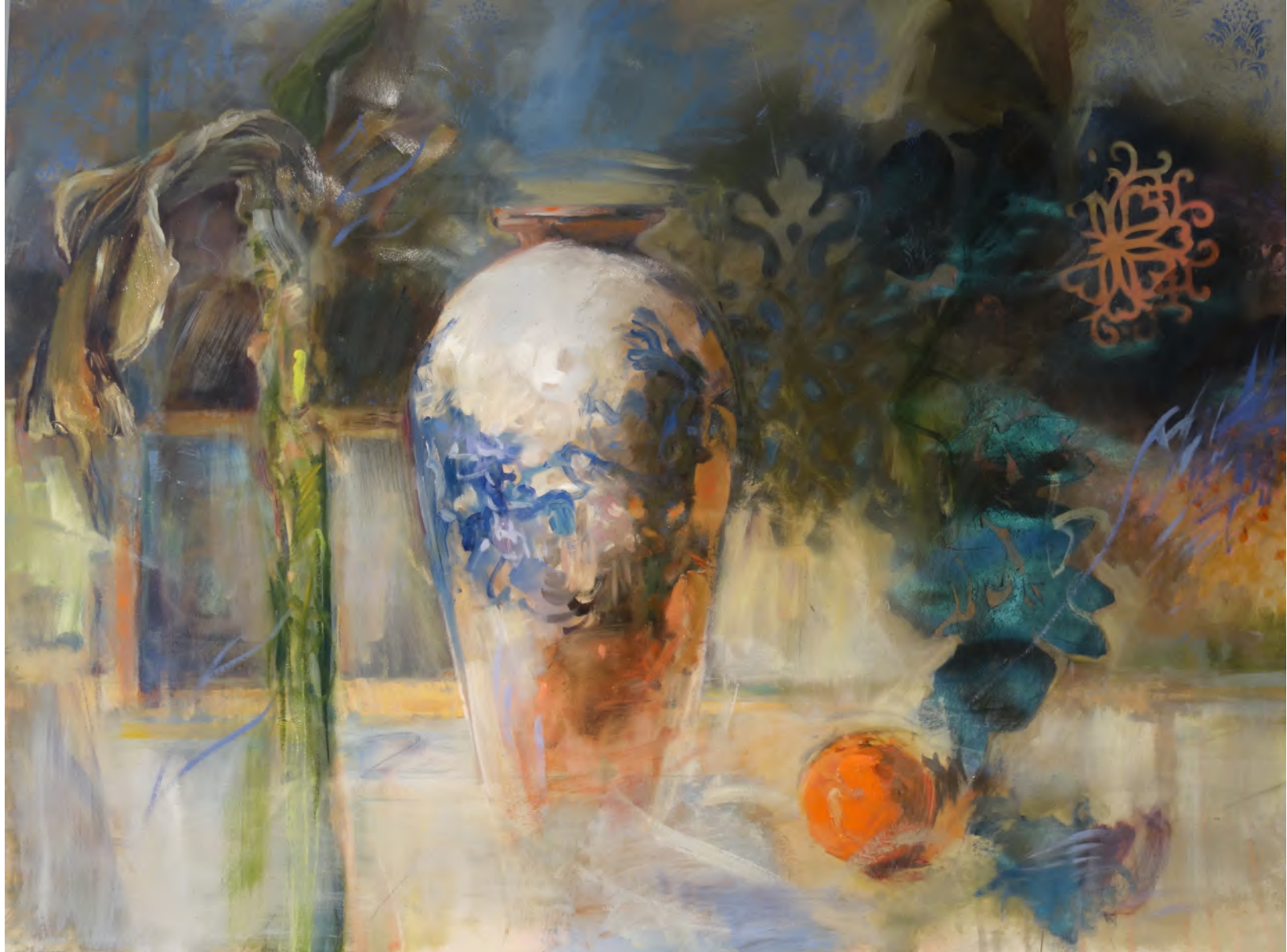
Jan Crawford-Winton Window Vase with Orange oil and mixed media 49.5" x 38.5" $4,000