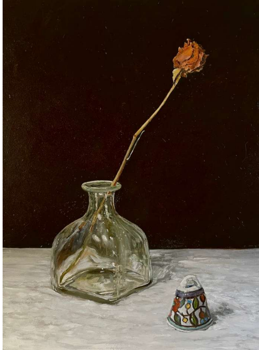
John Ens Ladder/Stem/Spine Oil on Panel 24" x 18" $1,200